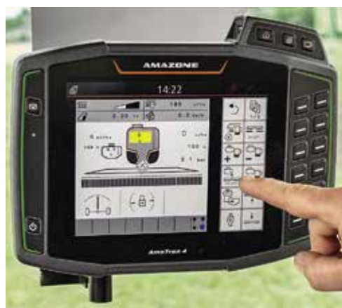
△ DirectInject is completely integrated in the circuit and the control system.