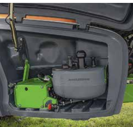
△ The metering pump sucks the product from a separate 50-litre tank.

Your contact to the editorial office: guido.boener@topagrar.com