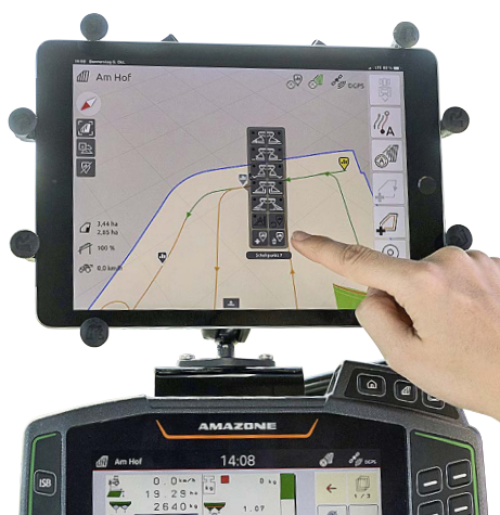
The on-off control points can be nudged or deleted and new points can be added.