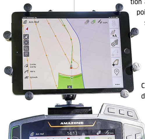
GPS-ScenarioControl defines the bouts, the direction of travel and the type of headland turn.

The operator merely has to switch the spreading discs on and off, possibly activate SectionControl, open the sliders and close them at the end of the application. GPS-ScenarioControl transmits the boundary spreading and HeadlandControl commands to the terminal and from here to the job processor on the broadcaster which executes the commands. This means that the various border spreading modes and the HeadlandControl feature are enabled/disabled automatically without any interference from the operator. When the tractor approaches a specific field position that requires switching, the broadcaster is commanded to select the specific mode or enable/disable HeadlandControl.