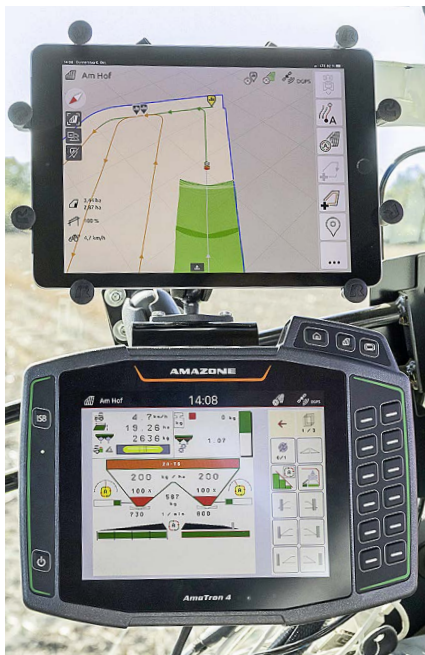
The Amazone app on the tablet communicates with the AmaTron 4 terminal. The photo shows the activated boundary spreading feature.

As GPS-ScenarioControl can be used on any type of machine for recording the tracks and the appropriate direction of travel, it can be mounted on a broadcaster but also on a sprayer to do the record-