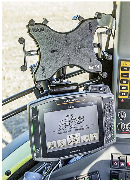
GPS-ScenarioControl requires a tablet with the AmaTron Twin app. The tablet can be mounted to the AmaTron 4 terminal with the RAM bracket that Amazone offers for 205 euros.

When recording or replaying is resumed after refilling the hopper, the screen displays orange coloured bouts which indicate treated areas and a marker that indicates the point where spreading was stopped and should be resumed. If the tractor passed a specific 'on-off switch' position while the scenario was being