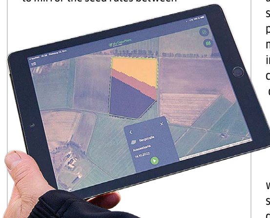
Two different wheat varieties are sown together to suit varying soils using an application map.

Michael plans seed maps using the mydataplant.com platform. Although this is not perfect for his needs, as the application allows you to change the seed rate but not to select a hopper, it is still useful. "I initially create an application map that specifies 100%, 50% and 0% seed rates. Based on these, I then make a second map for fertiliser application but use it to set the sowing rate for the second seed variety. This allows me to mirror the seed rates between