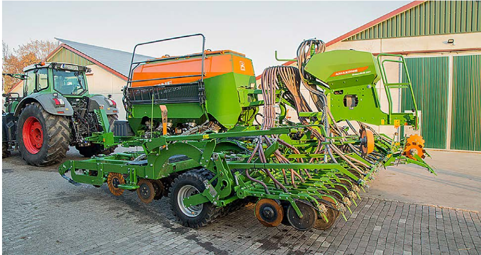
The drill is equipped with three hoppers.