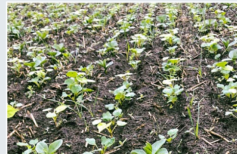
Briefly after drilling