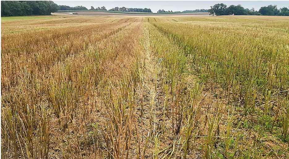
Left: oilseed rape without companion crops. Right: oilseed rape with companion crops. There is a difference in both yield and vigour.