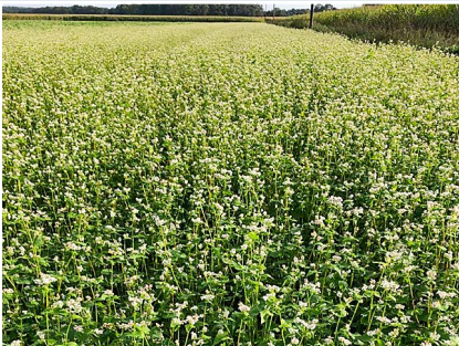
Ahead of the first frosts, buckwheat looks to be the dominant crop.