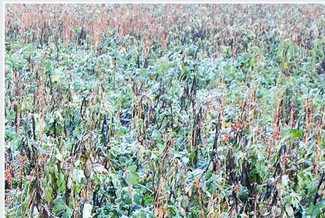
Mid-December, and the buckwheat and field beans have been severely affected by frost.