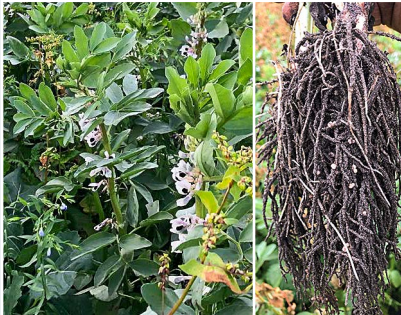
In late autumn, it's the turn of the beans to make a push.