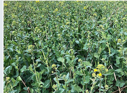
By the time flowering sets in, some of the companion crops have largely disappeared.