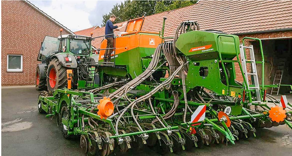
Which seeds go into which tank? And what sowing rates are appropriate? Adopting a multiple seed system will take experience.